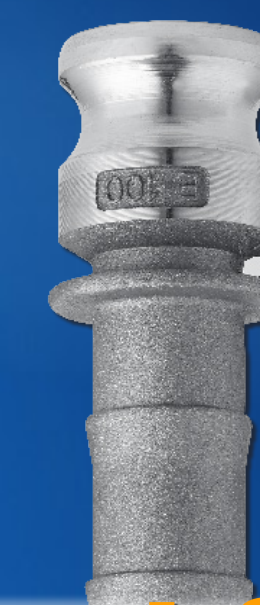
Part "E" Male Adapter X Hose Shank