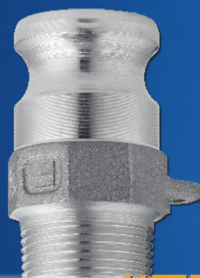
Part "F" Male Adapter X Male NPT