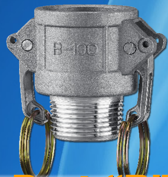
Part "B" Female Coupler X Male NPT