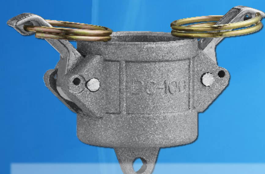
Part "DC" Dust Cap