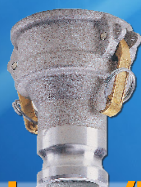
Reducer (DA) Female Coupler X Male Adapter