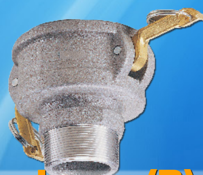
Reducer (B) Female Coupler X Male NPT