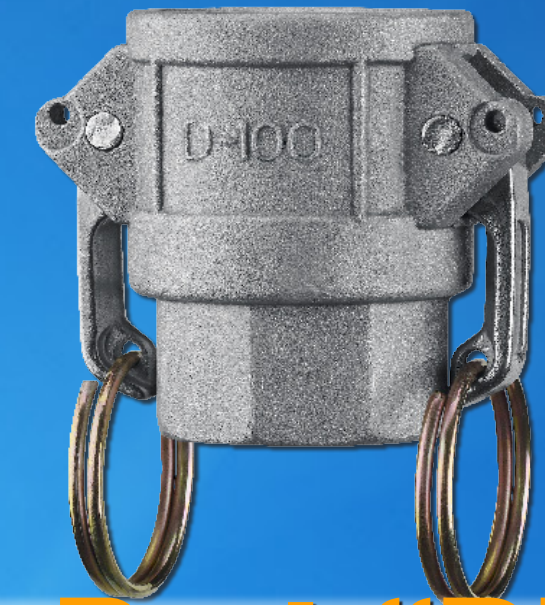
Part "D" Female Coupler X Female NPT