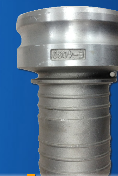
Reducer (E) Male Adapter X Hose Shank