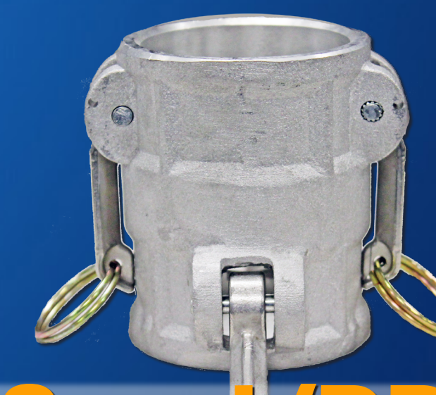
Spool (DD) Coupler X Coupler

Available from 1/2" to 8" in some materials