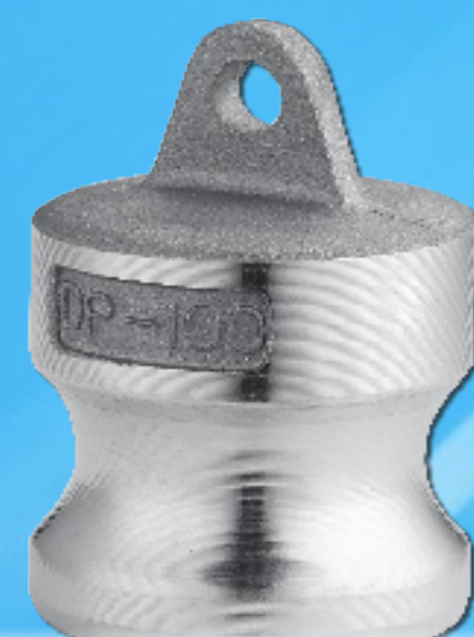
Part "DP" Dust Plug