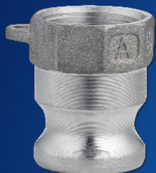
Part "A" Male Adapter X Female NPT