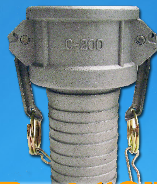
Part "C" Female Coupler X Hose Shank