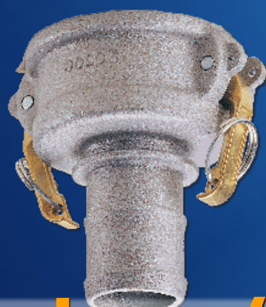
Reducer (C) Female Coupler X Hose Shank