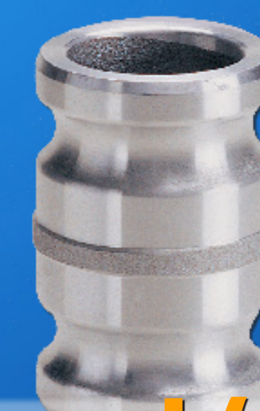
Spool (AA) Adapter X Adapter